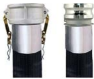
Camlock C X E