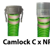
Camlock C x NPT