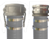
Camlock C X E