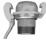
Male Ball x Male NPT