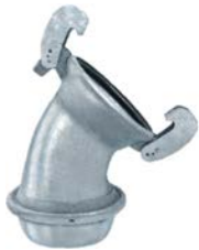
Male Ball x Female Socket 45°