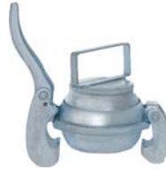
Male End Plug