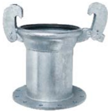
Female Socket x ANSI Flange