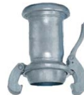
Female Socket x Male Ball Increaser