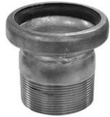
Female Socket x Male NPT