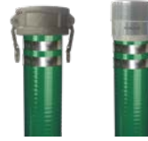
Camlock C x NPT