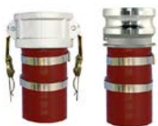
Camlock C X E