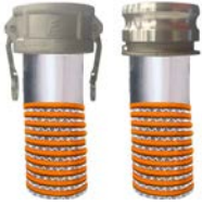
Camlock C X E