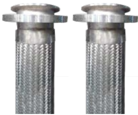
Floating x Floating