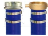
NPSH M x F