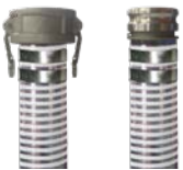
Camlock C X E