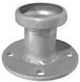
Female Socket x ANSI Flange Reducers