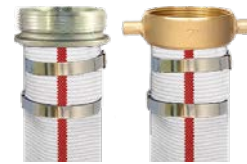
NPSH M x F