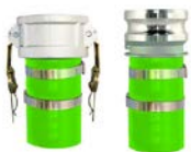
Camlock C X E