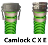
Camlock C X E