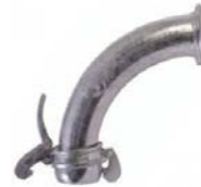
Male Ball x Female Socket 90°