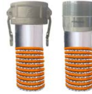
Camlock C X NPT