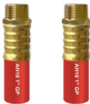
NPT x NPT