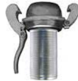
Male Ball x Machine Shank (KC)