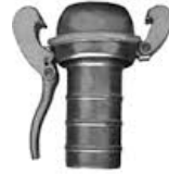
Male Ball x Shank