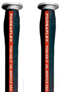
Floating x Floating