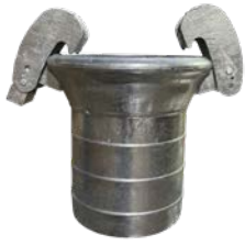
Female Socket x Shank