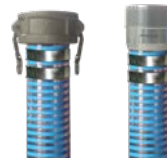
Camlock C x NPT