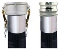
Camlock C X E