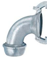
Male Ball x Female Socket 90°