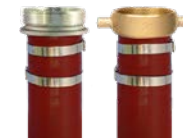
NPSH M x F