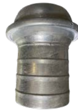
Male Ball x Shank