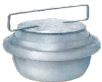
Male End Plug