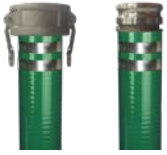
Camlock C X E