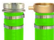
NPSH M x F