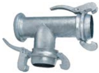
Inline T with Male Branch