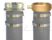
NPSH M x F