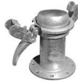
Male Ball x ANSI Flange Reducers