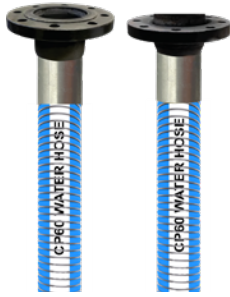
Fixed x Floating