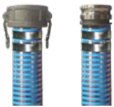
Camlock C X E