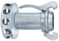
Male Ball x Round Hole Strainer