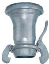
Female Socket x Male Ball Reducer