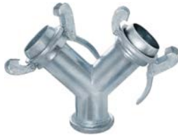
Double Male Ball - Y