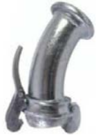
Male Ball x Female Socket 45°