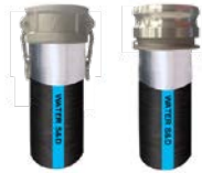
Camlock C X E