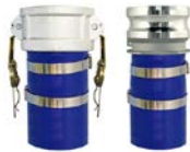
Camlock C X E