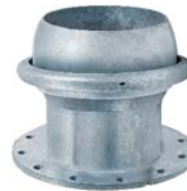
Male Ball x ANSI Flange