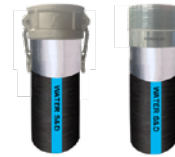
Camlock C X NPT