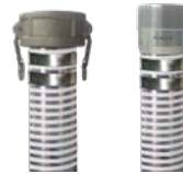
Camlock C x NPT