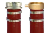
NPSH M x F