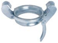
Bauer Locking Lever