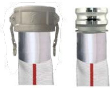
Camlock C X E