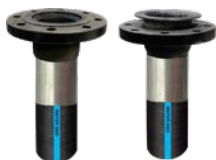
Fixed x Floating