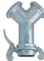
Double Female Socket - Y